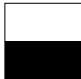
1/2 Page Horizontal