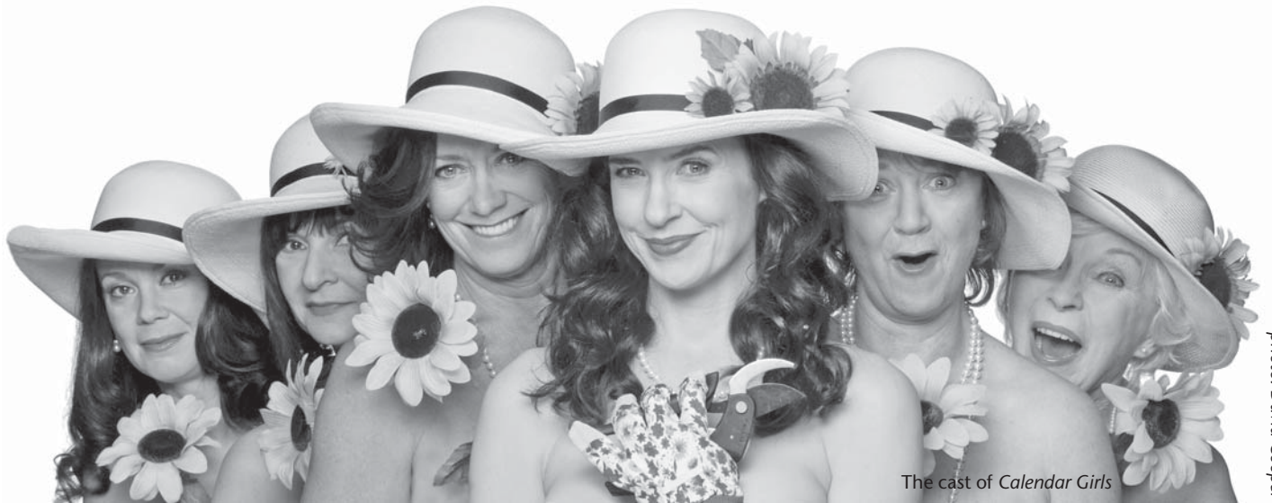
The cast of Calendar Girls